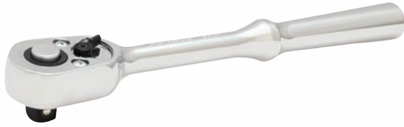
Quick Release Ratchet