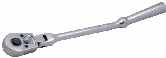
Reversible Ratchet - Flexible Head With Bent Handle

Federal Spec. CDA 39-GP-12b U.S. GGG-W-641E ANSI B107.10M