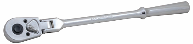
Reversible Ratchet - Flexible Head

Federal Spec. CDA 39-GP-12b U.S. GGG-W-641E ANSI B107.10M